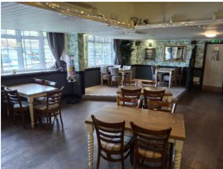
(9) Dance floor / elevated performer area within The Royal Oak PH