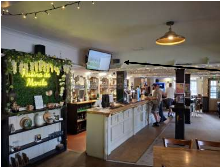
(10) Noise limiter serving dancefloor/performer area of the main bar within The Royal Oak PH