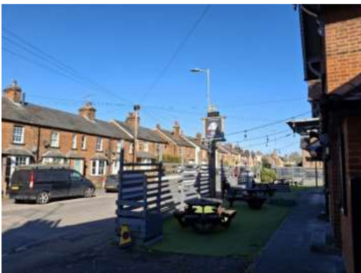
(3) Dwellings off Walkern Road as taken from front of The Royal Oak PH