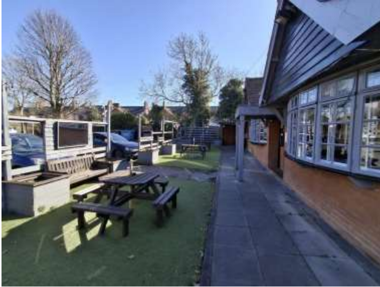
(6) The northeast elevation of The Royal Oak PH and beer garden / smoking area (far end)