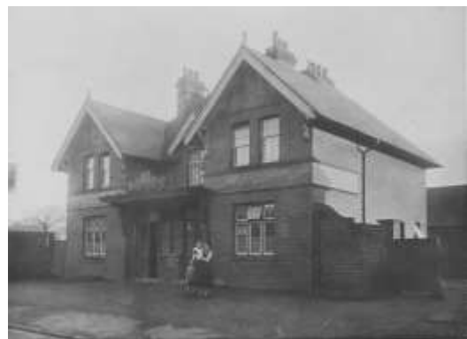
Royal Oak, 1932

The Royal Oak public house is a detached building situated off Walkern Road in north-east Stevenage (please see plans overpage). It is understood that the main structure of the pub was erected around 1899 with subsequent alternations taking place, such as