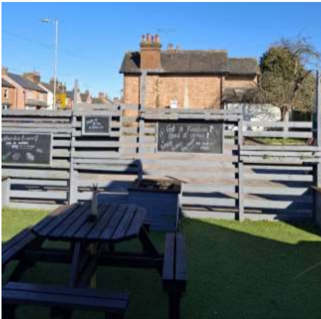
(7) Beer garden and dwelling (far side of car park) as taken from The Royal Oak PH