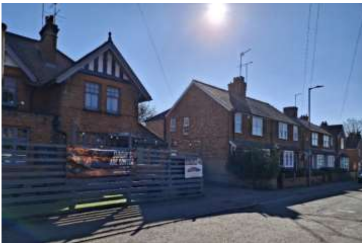
(2) The Royal Oak PH taken from Walkern Road facing west