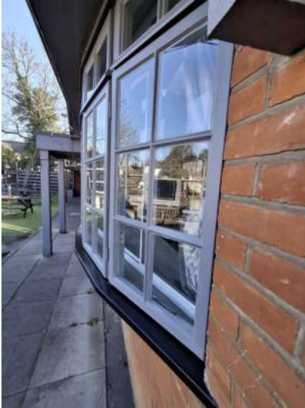
(8) The windows on northeast elevation of The Royal Oak PH