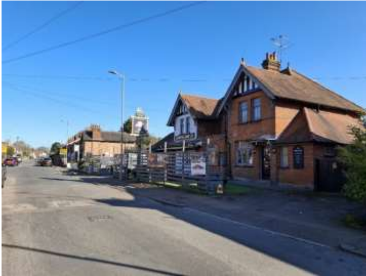
(1) The Royal Oak PH taken from Walkern Road facing east

The images below and over page were captured this year and illustrate the positioning of the Royal Oak PH in the context of other buildings in its vicinity.