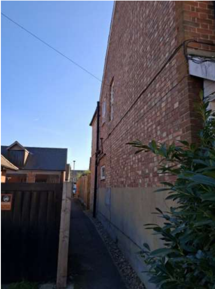
(4) Alleyway to west of The Royal Oak PH as taken from Walker Road