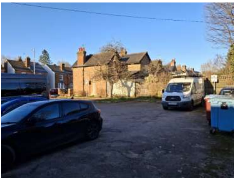
(5) The Royal Oak car park facing northeast